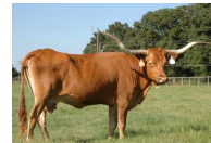
OVERWHELMERS JACK KCC